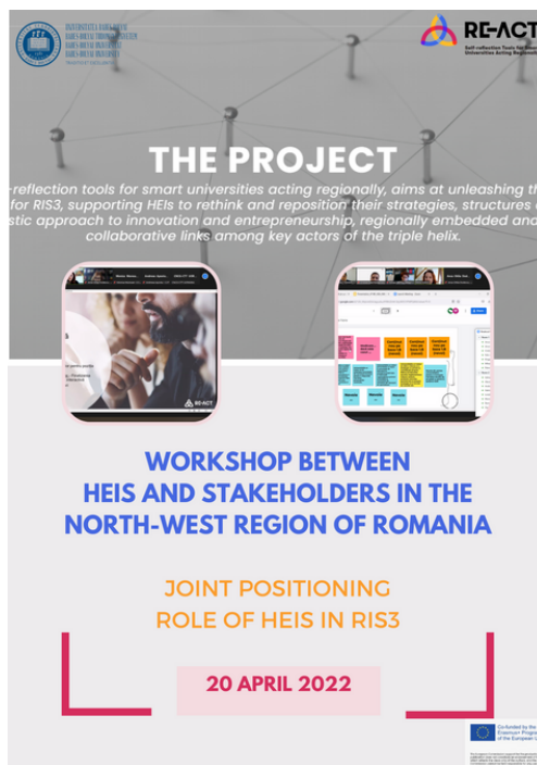
Workshop organised by UBB on 20th April 2022